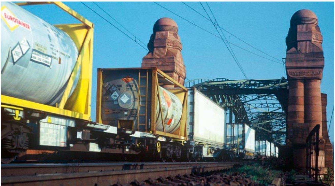
The Rhine-Alpine Corridor passes through the industrial heart of Europe.

The Rotterdam/Antwerp–Zeebrugge corridor is one of the most important routes for freight traffic in Europe and this is why it is currently being expanded. The New Rail Link through the Alps (NRLA), which includes the Lötschberg and Gotthard base tunnels, forms part of this corridor.